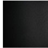
GFM73 gofrado negro