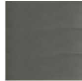
OP0 barnizado transparente