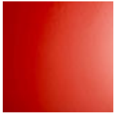
FL64 naranja fluo