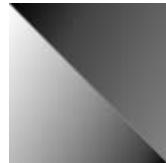
transparente extraclaro biselado