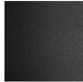
GFM69 gofrado graphite