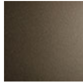
GFM11 gofrado titanio